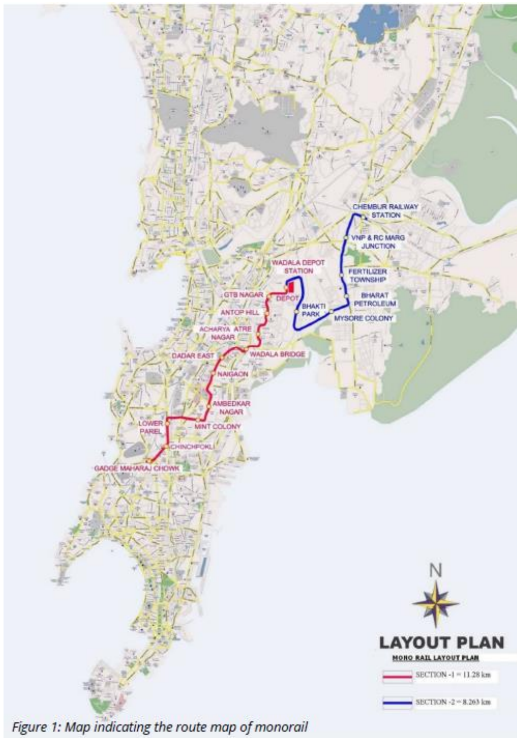
Figure 1: Map indicating the route map of monorail