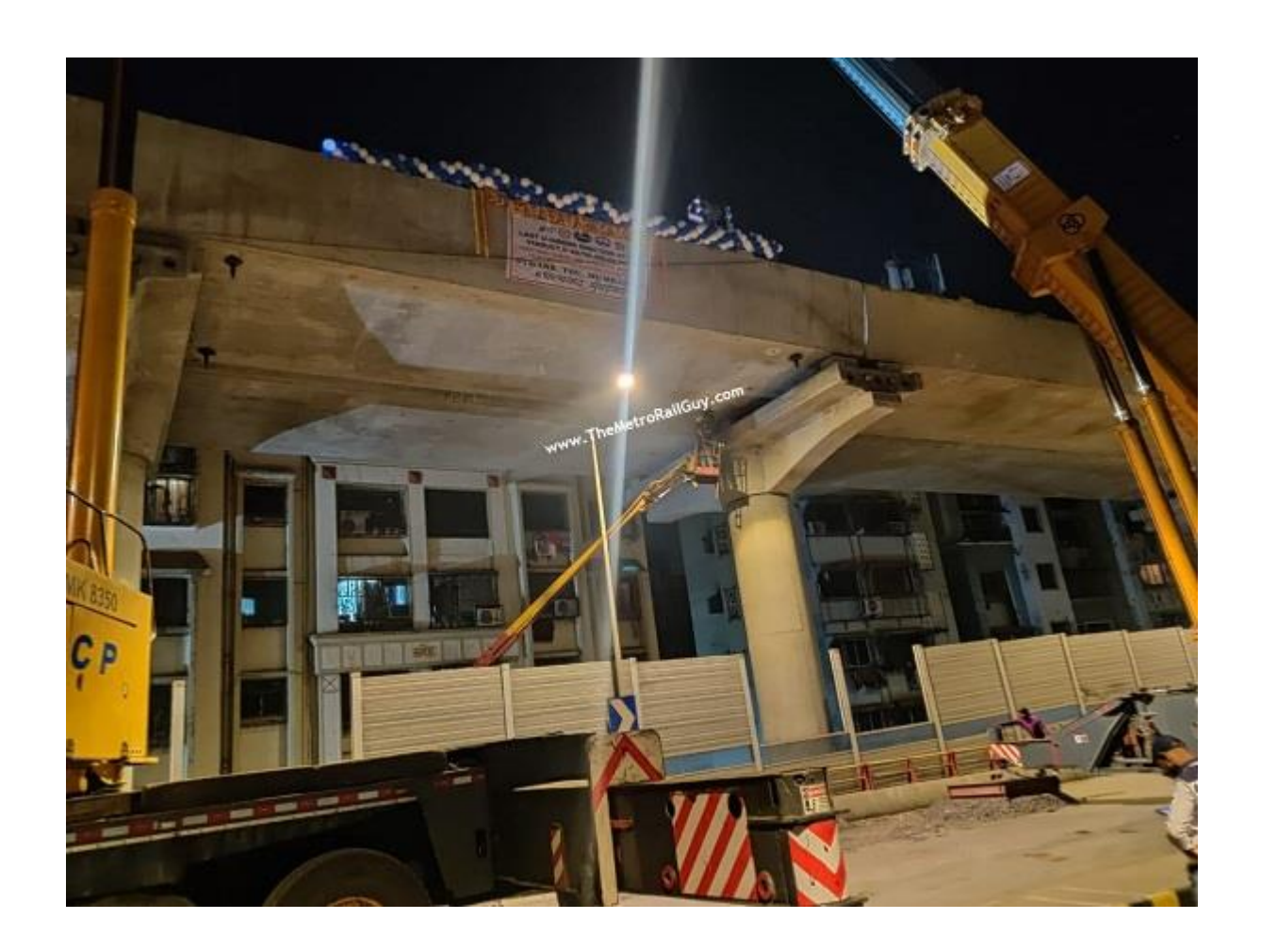
Article Link: <a href="https://themetrorailguy.com/2021/02/06/j-kumar-launches-mumbai-metro-line-2a-ac-01s-final-u-girder/">https://themetrorailguy.com/2021/02/06/j-kumar-launches-mumbai-metro-line-2a-ac-01s-final-u-girder/</a>